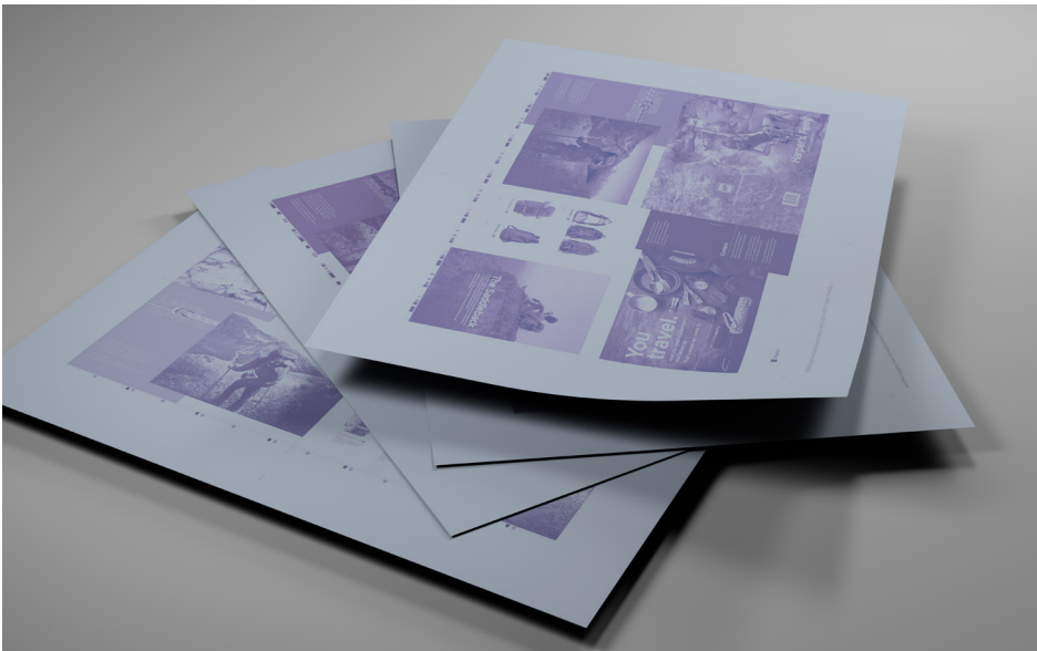
The TRENDSETTER Q400/Q800 Platesetter is fully compatible with SONORA Process Free Plates.

The new, optional, KODAK Mobile CTP Control App lets you monitor your TRENDSETTER Q400/Q800 Platesetter remotely with your Android or IOS device. Know instantly if one of your CTP devices needs attention, even if you are out of the room or off site, so you can get back to making plates quickly.