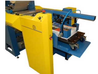
Optional Pallet Stacker