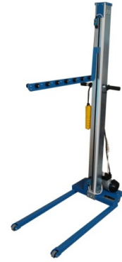
Optional Film loader

*Important - the machine must be operated with a Jogger.